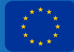
Erasmus Open Spaces

Outgoing exchange students (both Erasmus and Outside of Europe exchange) must meet certain academic requirements to study abroad. This criteria is clearly set out on the College of Engineering and Architecture website here .